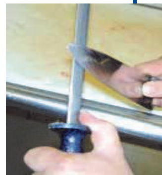
Unsafe way to sharpen knives