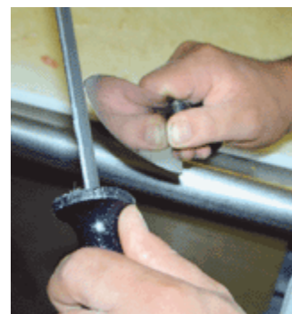
Safer way to sharpen knives