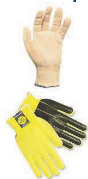
Gloves protect against blade