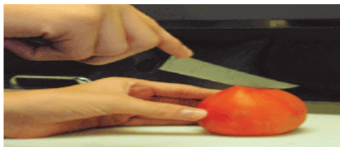
Cut away from the body keeping thumb out of the cutting line