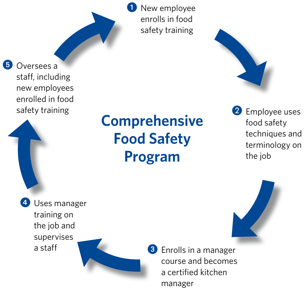
Figure 1: Comprehensive Food Safety Program